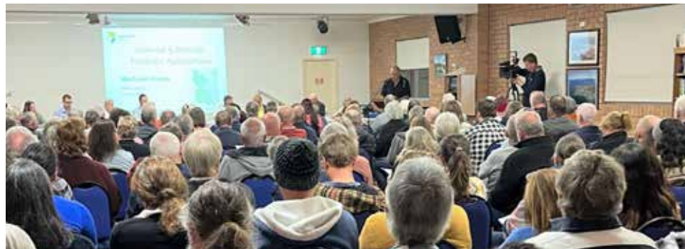
Above: Road Safety Meeting at Coomba Community Hall.

The Road Safety Meeting at Coomba Community Hall on the 13 July was well attended with a total of 129 people.